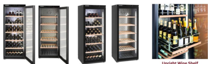
Upright Wine Shelf